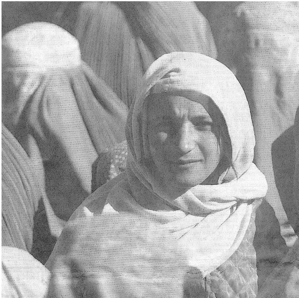
young Afghan woman showing her face in public on Wednesday in Kabul for the first time in years. Many women are hoping for such rights as the ability to walk outside without being escorted by a male relative