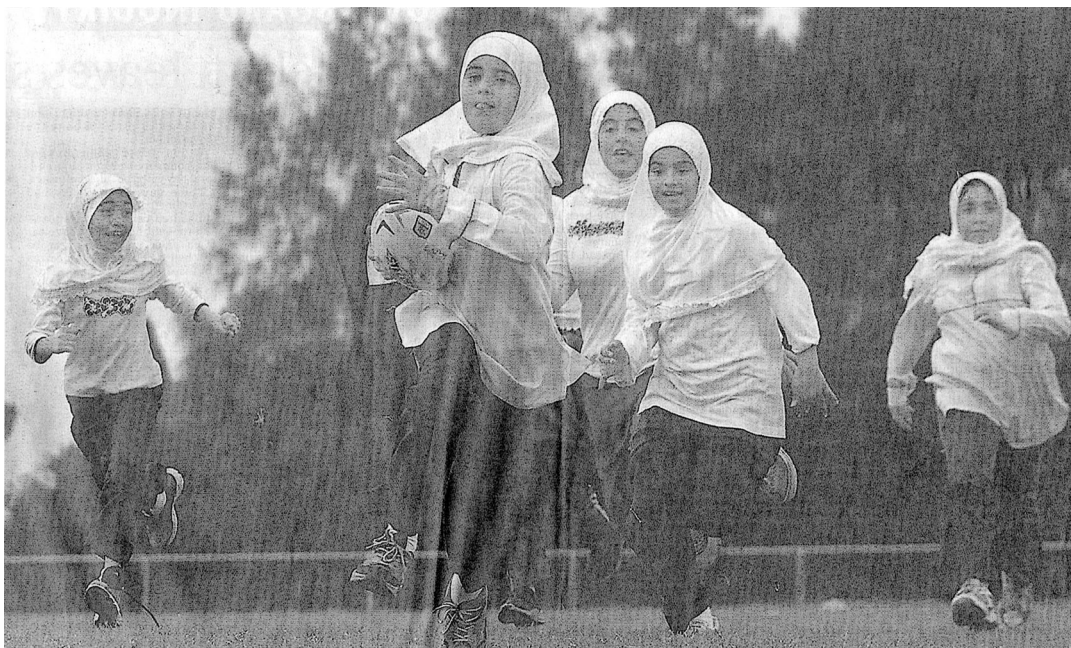
On the burst: Noor al Houda players go up the middle on girls' rugby league trial day at the Sydney suburb of Greenacre yesterday

The novelty of this particular photograph allows us to make some comments about the conventional associations of the veil. The photograph shows women who are active rather than passive; who are at home in the outdoors rather than being secluded in private space. This image of the veiled woman as an active agent engaged in joyous physical activity in the outdoors has a deconstructive function, in opening up alternative trajectories of the representation of the veiled woman.