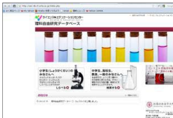
Retrieval system for scientific research by students